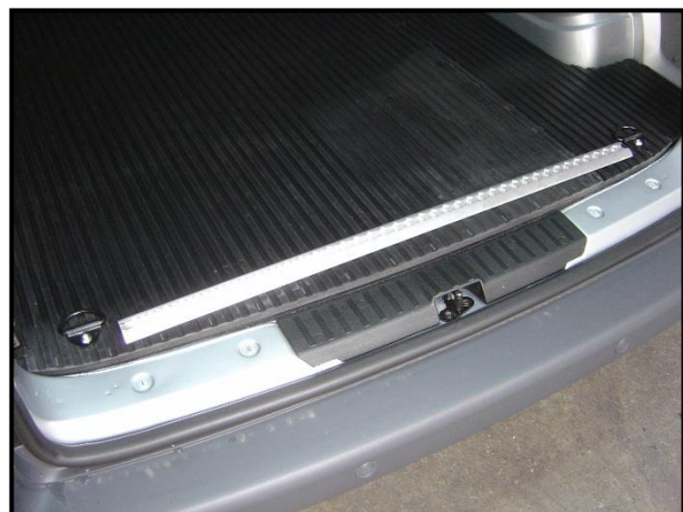
Aluminium protective rail located at the rear